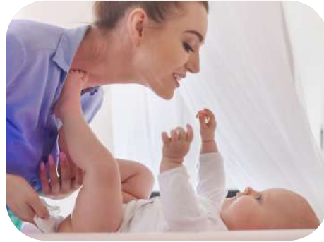
Newborn & Child Care