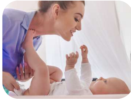
Newborn & Child Care